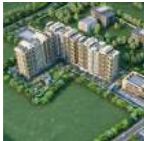
SKYWAYS ESFERA PHASE -1 Lohegaon - Pune