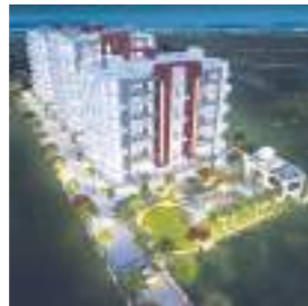
SKYWAYS SERENO Lohegaon - Pune