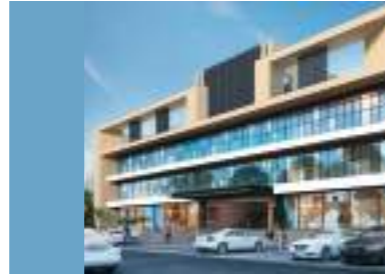
SKYWAYS ONE Lohegaon - Pune