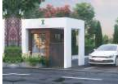
SKYWAYS VRUNDAVAN PHASE - 1 Charholi - Pune