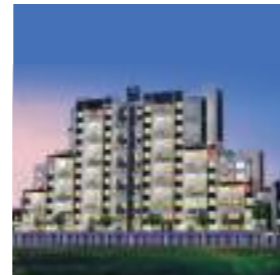
UNIQUE RESIDENCY Wagholi - Pune